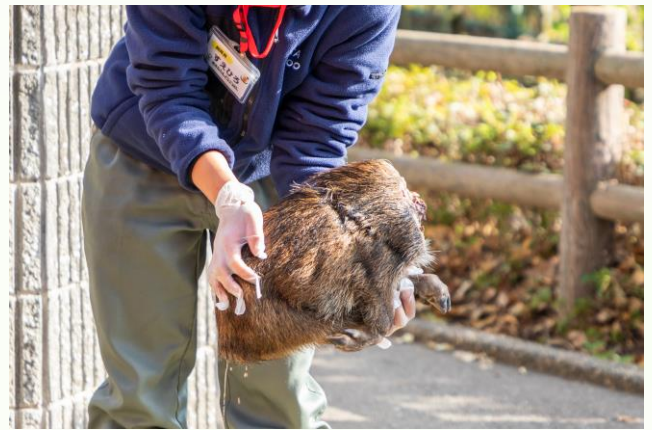
The gift was a wild boar.