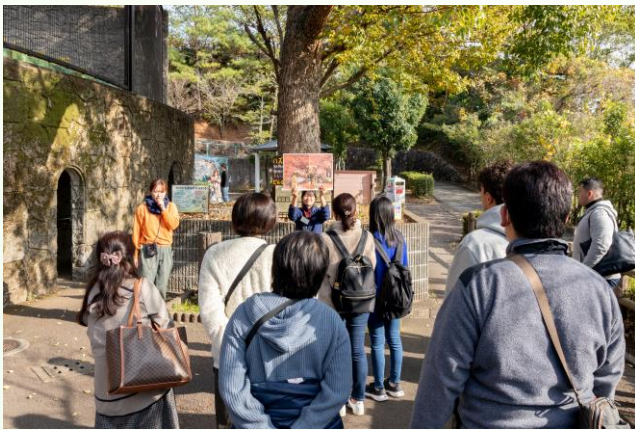
A keeper explains about carcass feeding.

It is about enriching the environment so that animals can live better, both physically and mentally.